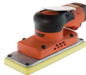
3 x 8 inch