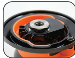
Fan blade cooling system