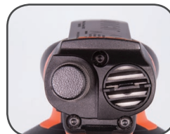
360° rotating exhaust vanes