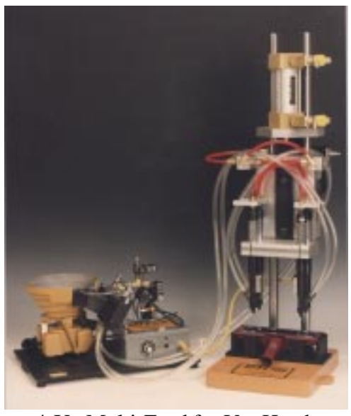
4-Up Multi-Feed for Vac Head

37 Conifer Drive N. Providence, RI 02904-3020 401 354 8878 FAX 401 353 0113 Mobile Phone 401 529 6428 1 800 353 4676