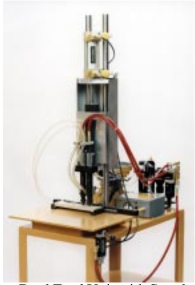
Dual Feed Unit with Stand