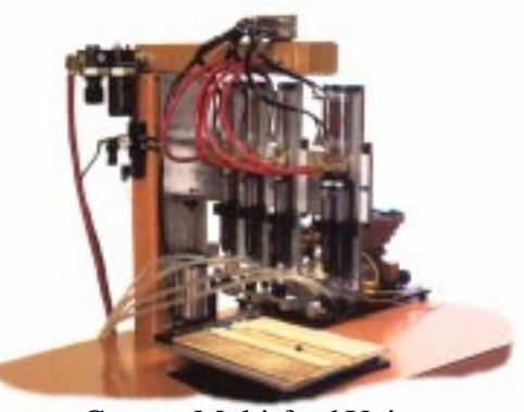
Custom Multi-feed Unit