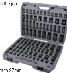
Model: SK34C86 Sizes 5/16" to 1-1/4" and 9mm to 27mm