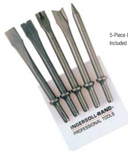
5-Piece Chisel Kit Included with 116K and 117K