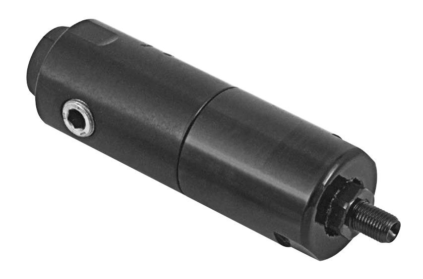
Standard 21 Series Motor Shown

For additional product information visit our website at http://www.apextoolgroup.com